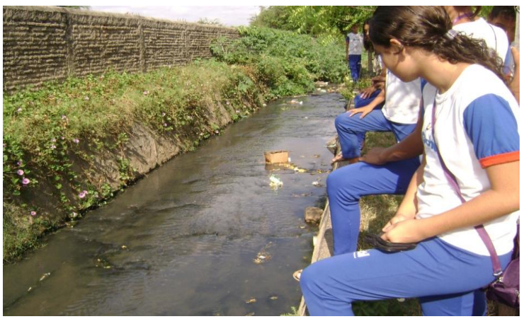
FIGURE 3 - Students on the banks of a canal that empties into the Rio Pianco, Pombal - Paraíba.

Visit the channel aimed to show the reality of the river, where we observed the amount of industrial and domestic waste are thrown into the river daily (Figure 3), moreover, students still found the amount of litter accumulated near the channel (Figure 4) by nearby residents, although there is a regular service of garbage collection in the city.