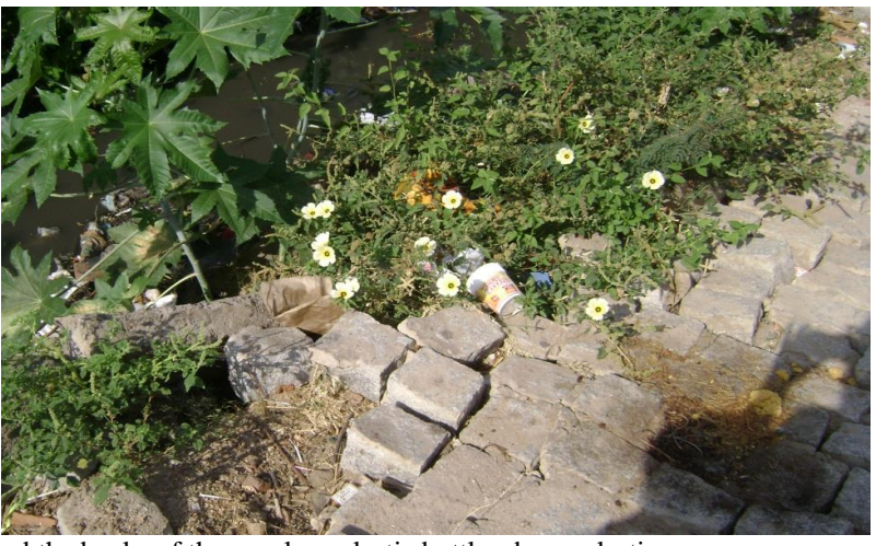
FIGURE 4. Garbage dumped the banks of the canal, as plastic bottles, bags, plastic cups.

the process of environmental education learning and communication problems related to the interaction of men with their natural environment. It is the instrument for forming an awareness through knowledge and reflection on the environmental. (COSTA, 2004), a participatory process through which individual and collective social values construct ... (MOTA and AQUINO, 2003).