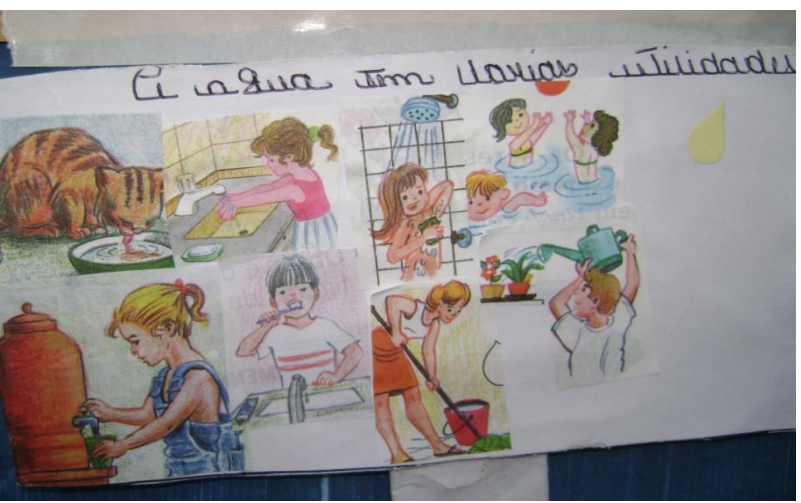
FIGURE 7. Poster group organized by the students: "Rational use of water."

On the topic "Rational use of water", the students organized a poster presentation, Figure 6, and lines between the characters that took place in a classroom, a teacher (student) explaining to the students present on the importance of water and about the need for rational consumption. Figure 7.