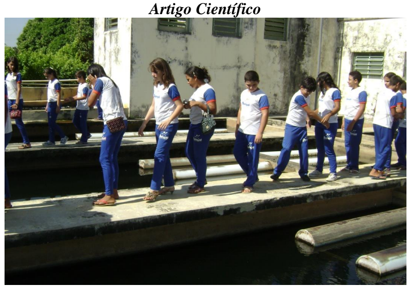
FIGURE 6. Students following the technical and observing the phases of water treatment.

Finally, the fifth work activity, students were divided into 5 groups of 8, to organize plays, with the help of art teacher, to present, with the following themes: Rational use of water and its effects on the environment, irrational use of water and its impact on the environment, distribution of water on the planet, the importance of the hydrological cycle and water pollution. The students were